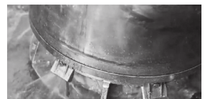
Hydraulic barrier to keep fibre out