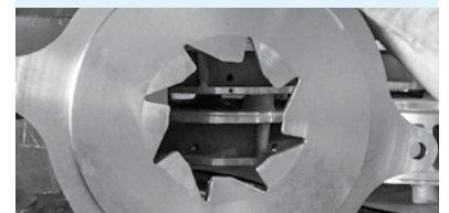
Cutting plate to chop fibre down